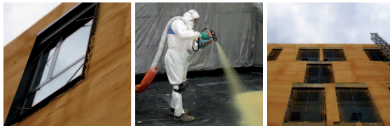
Main Applications: Polyurethane Foam & Coatings - Polyurea

GAMA SPRAY EQUIPMENT Designed with the Customer in Mind!